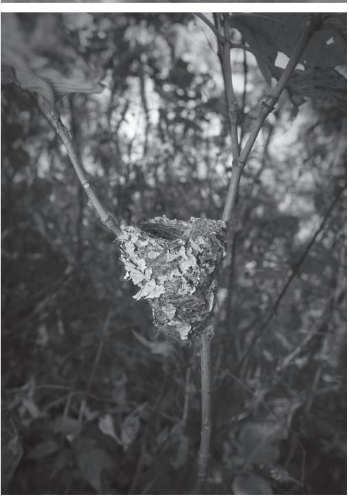
Figure 3 (below, right). Nest and eggs of Margaret's Batis Batis margaritae , Luanda forest, Mount Moco, Angola, July 2010 (A. Vaz)

Figure 2 (below, left). Nest of Margaret's Batis Batis margaritae , Luanda forest, Mount Moco, Angola, July 2010 (A. Vaz)