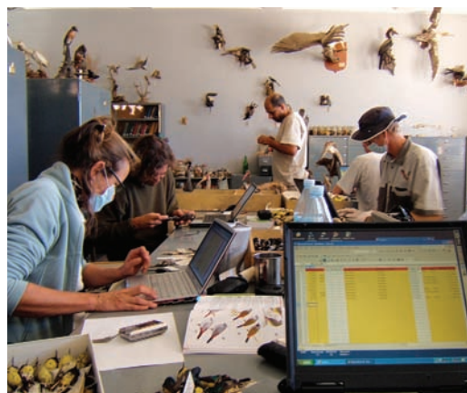
Figure 1. The team working on the skin collection, entering details from bird labels into a database (Michael Mills)

Recent peace and stability have provided new opportunities for improving the situation. As a first step, old reserves need to be re-established, knowledge of species distributions updated and