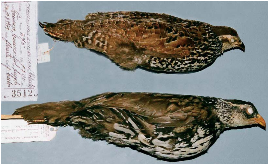
Figure 2. A female (top) and male (bottom) specimen of Swierstra's Francolin Francolinus swierstrai from the collection of the Instituto de Investigação Científica do Angola in Lubango (city), Angola, with the label of the female enlarged (top left) to show a date of what appears to read '31-8-1979'

Spécimens femelle (en haut) et mâle (en bas) du Francolin de Swierstra Francolinus swierstrai de la collection du Instituto de Investigação Científica do Angola à Lubango, Angola, avec l'étiquette de la femelle élargie (en haut à gauche) pour montrer la date qui semble être '31-8-1979'