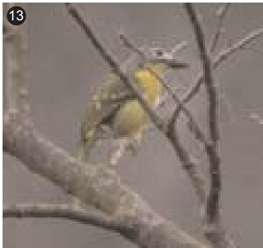
Captions are on page 153